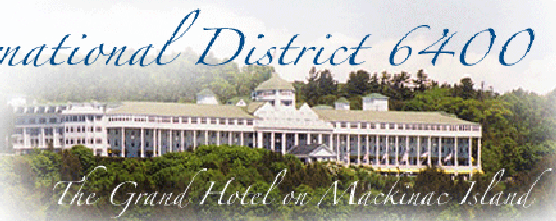
The Grand Hotel on Mackinac Island

District Conference April 30 - May 3, 2009