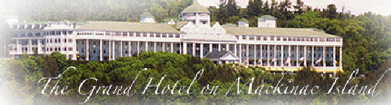
The Grand Hotel on Mackinac Island

District Conference April 30 - May 3, 2009