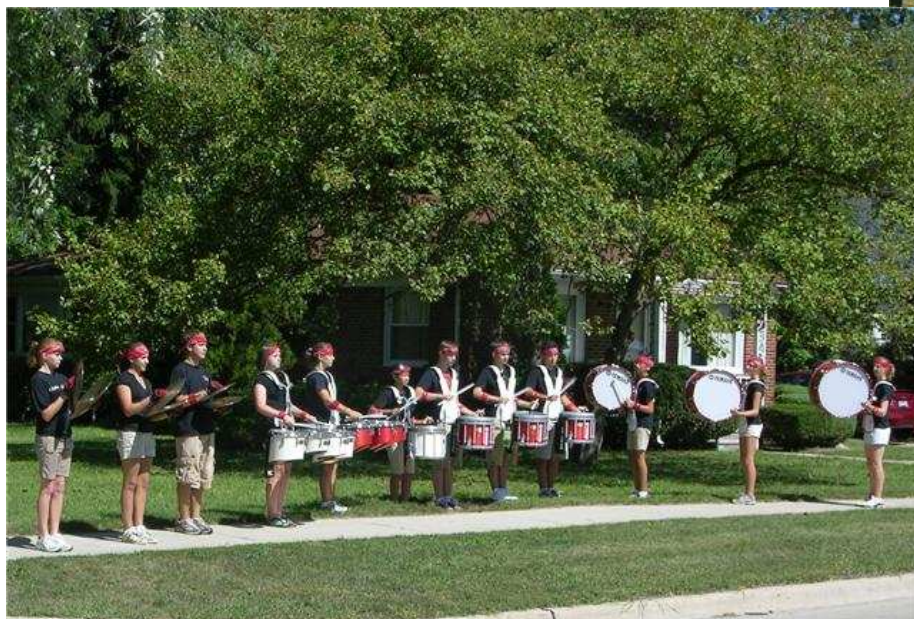
Grosse Ile High Drum Line